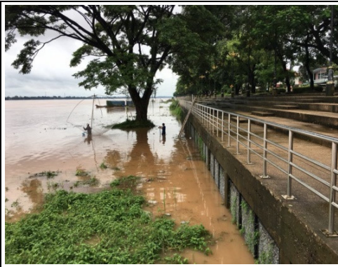
Rising River Reaches Nakhon Phanom City