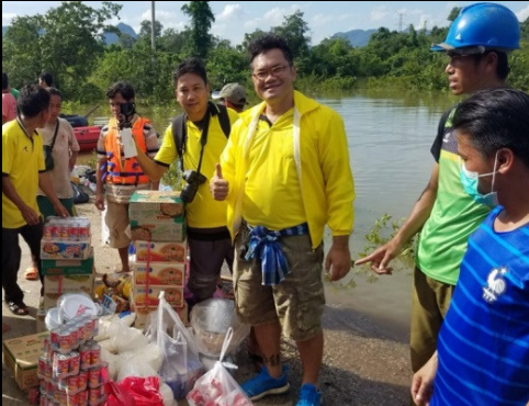
Baaw Ter Center Distributing Food in Laos