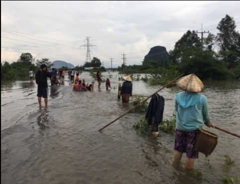
Laotian Reservoir Broke, Villages Flooded