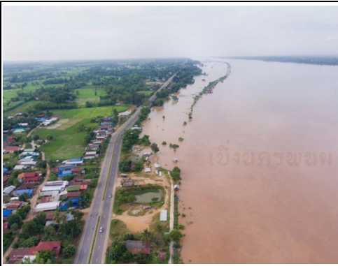
Mekong Beginning to Overflow Its Banks